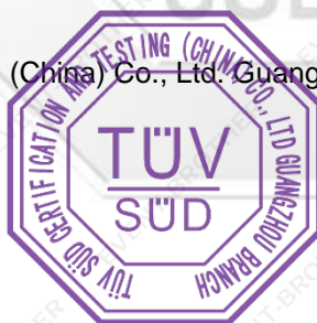
Adam Hou Designated Reviewer

Note: (1) "General Terms & Conditions" applied. For full version, please visit: http://www.tuvsud.cn/cn-scn/terms-and-conditions 2) Any use for advertising purposes must be granted in writing. This technical report may only be quoted in full. This report is the result of a single examination of the object in question and is not generally applicable evaluation of the quality of other products in regular production. For further details, please see testing and certification regulation, chapter A-3.4. 3) The conclusion of test result was drawn according to corresponding regulation or standard method and/ or client's requirement